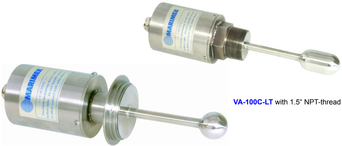
VA-100C-LT with 1.5" NPT-thread